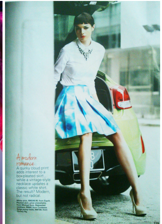
A modern romance A quirky cloud print adds interest to a box-pleated skirt, while a vintage-style necklace updates a classic white shirt. The result? Modern, but not radical. White shirt, $249.95, from Express. Pleated skirt, price unavailable, from Michael Kors. Reversible necklace, $299, from Coty. Ring, $199, from Chloé. Bag, $199, from Chloé.